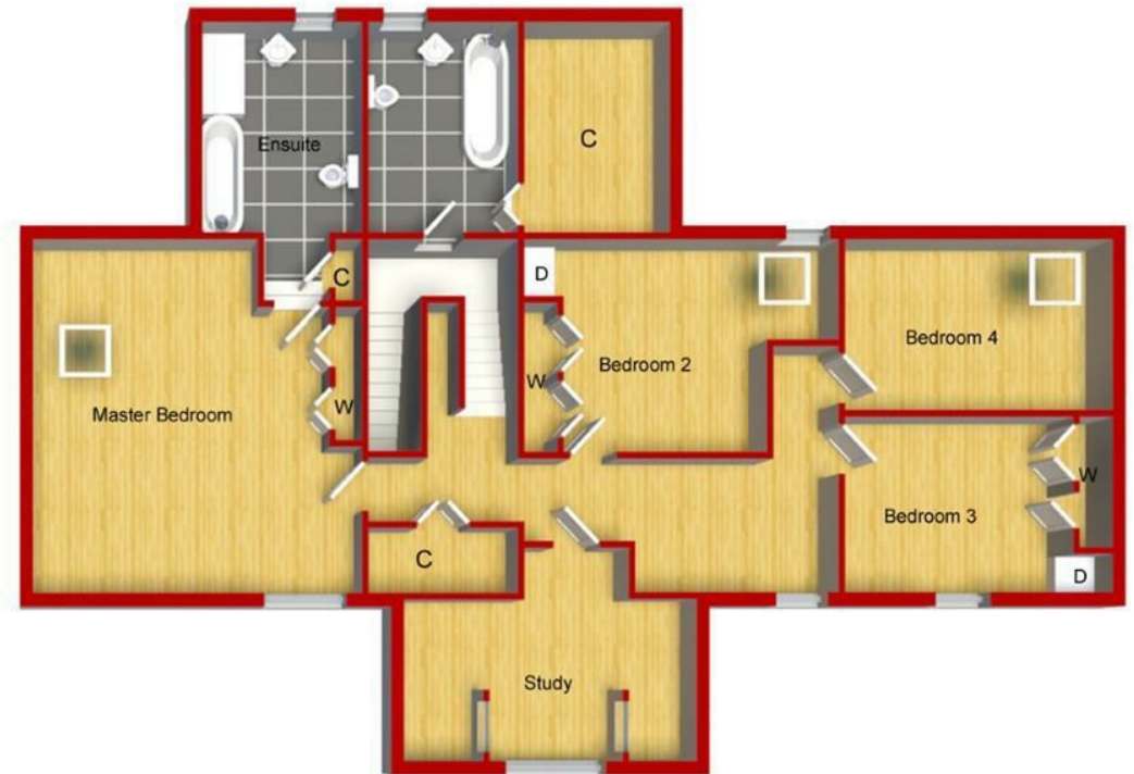
Room In Roof Approximate Floor Area (103.58 sq.m)