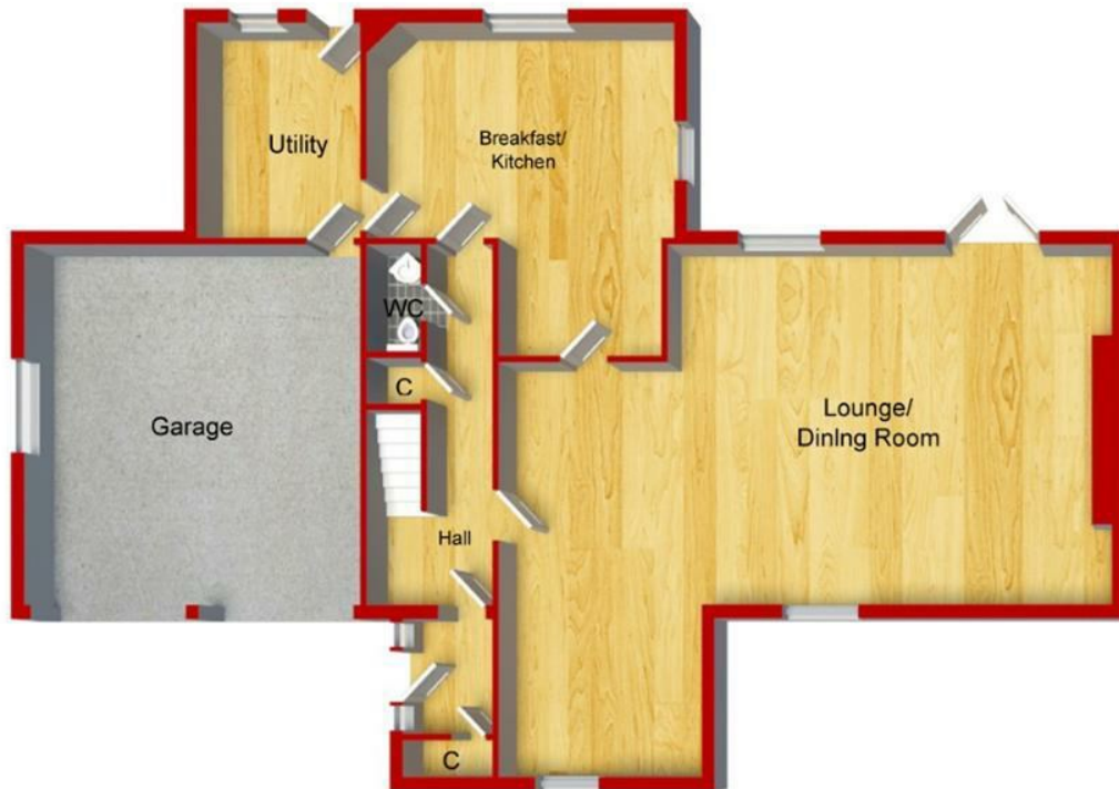
Ground Floor Approximate Floor Area (86.72 sq.m)