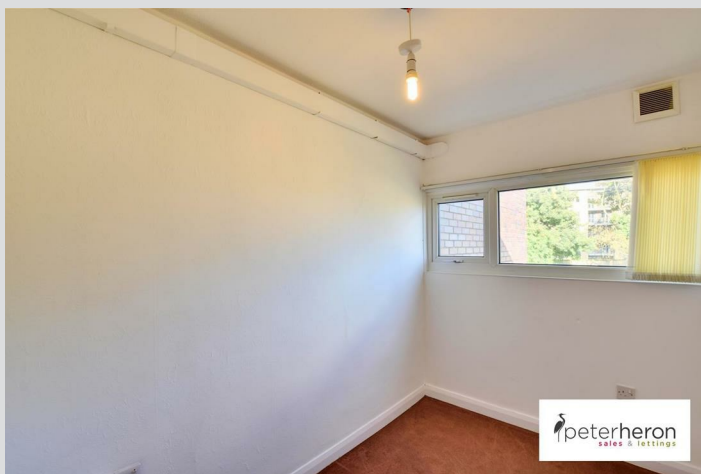
Double glazed window to front and radiator.