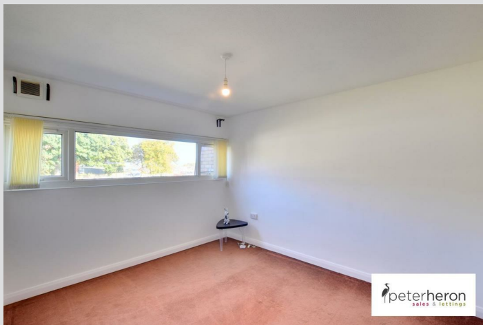
Double glazed window to front and double radiator.