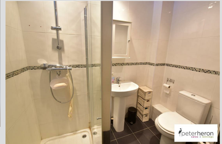
Low level WC, washbasin and walk in shower cubicle, tiled walls and floor, single radiator.

Visit www.peterheron.co.uk or call 0191 510 3323