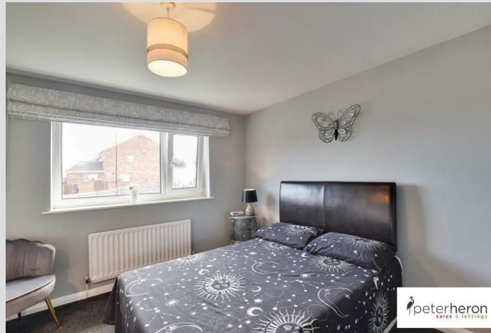
Double glazed window, fitted wardrobes and single radiator.