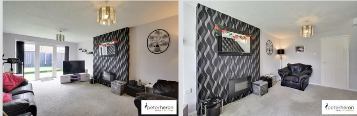
Wall mounted electric fire, double radiator, double glazed window and door to rear.