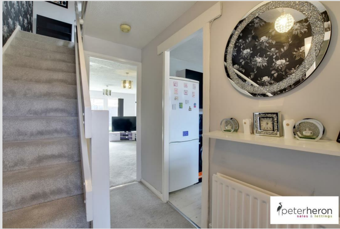
Staircase to first floor, understairs storage and double radiator.