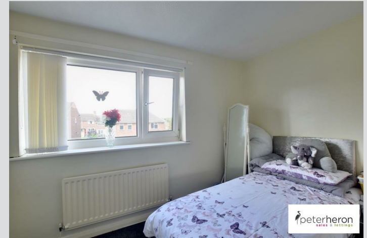
Double glazed window, fitted wardrobes housing the combi boiler and single radiator.