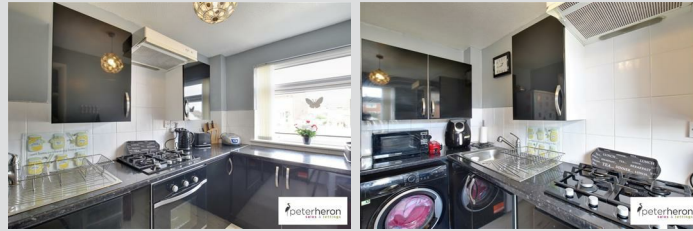
Base and eye level units with work surfaces over incorporating sink and drainer unit, tiled splashbacks, integrated oven and hob with extractor, space and plumbing for washing machine, double glazed window to front, wood effect laminate flooring.