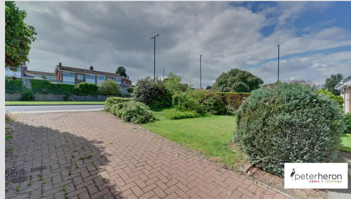
There are attractive mature gardens to the front and rear laid mainly to lawn with established planting, there is also a driveway providing off street parking and an attached single garage.