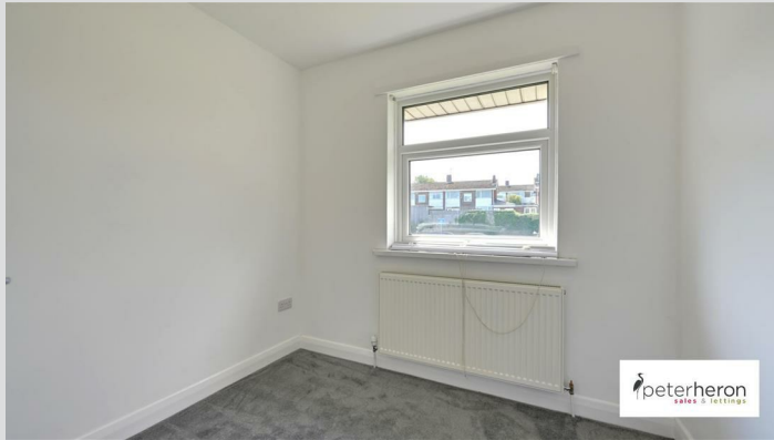
Double glazed window to the front and a radiator.