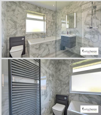
A fabulous contemporary bathroom with a low level WC with concealed cistern, wash hand basin set into vanity unit, bath and walk in shower area with mains fed shower, there is a ladder style radiator, a tiled floor and double glazed window.