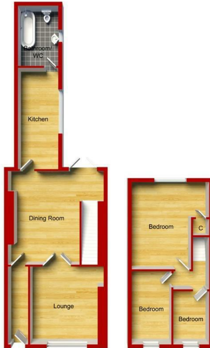
Ground Floor Approximate Floor Area (58.10 sq.m)