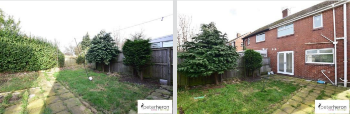
Block paved driveway to the front and garden to the rear.