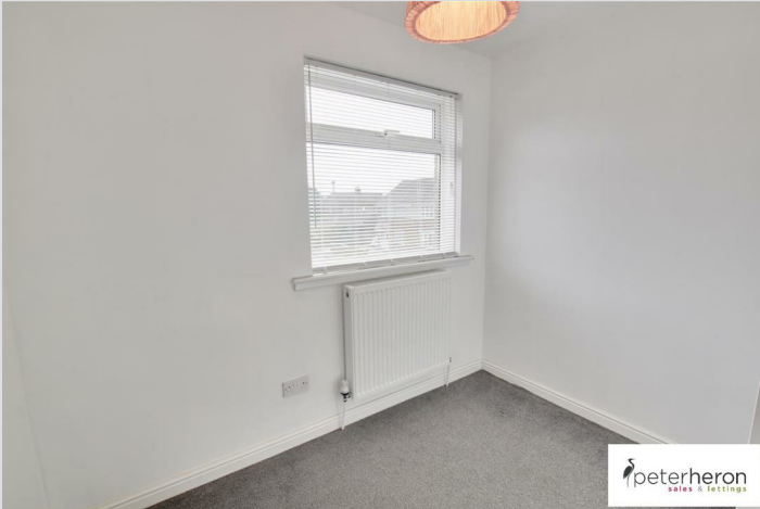
UPVC double glazed window, storage cupboard and radiator.