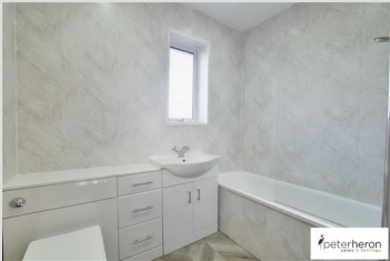
Low level WC, washbasin vanity unit with cupboards and drawers, and panel bath with overhead shower, heated towel rail and double glazed window.