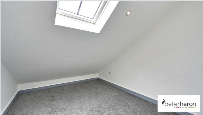
Approximate measurements as sloping ceiling, Skylight window and radiator.