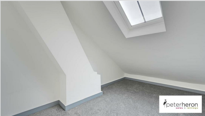
Approximate measurements as sloping ceiling, Skylight window and radiator.