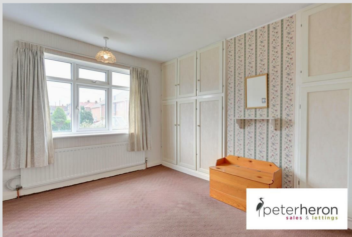
Bedroom 2 13'0" x 9'7" not inc robes

Double glazed window to rear, radiator and built in wardrobes.