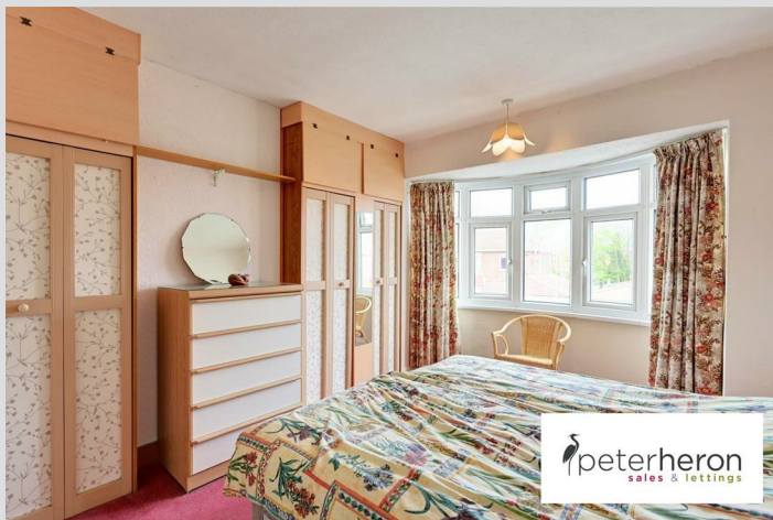
Bedroom 1 14'10" into bay x 9'3" not inc robes

Double glazed bay window to front, radiator and built in wardrobes.