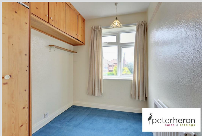
Bedroom 3 8'4" x 6'7"

Double glazed window to rear, radiator and fitted wardrobes and cabinets.