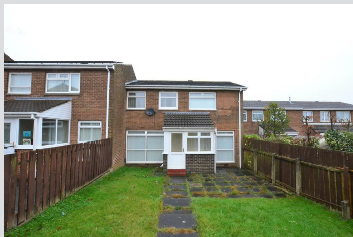
A lawned garden to the front with gated access. Rear lawned garden with mature shrubs with a driveway and garage providing off street parking.