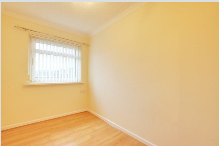
UPVC window to front, laminate flooring, single radiator.