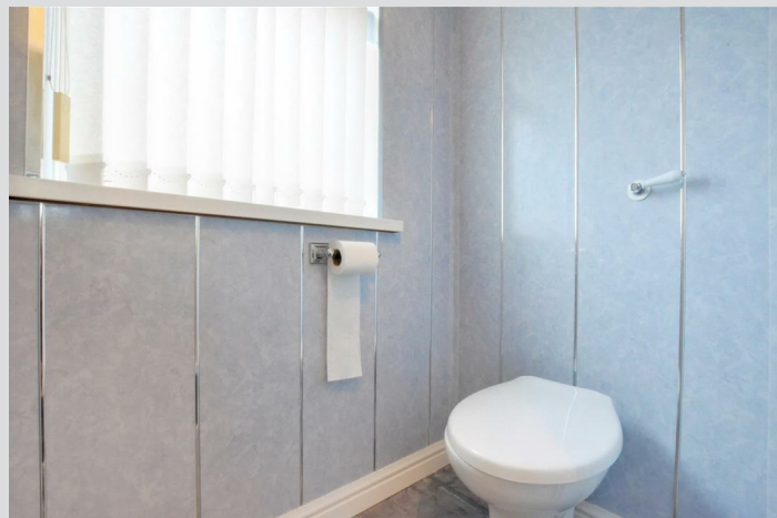
Low level WC, UPVC window to rear.