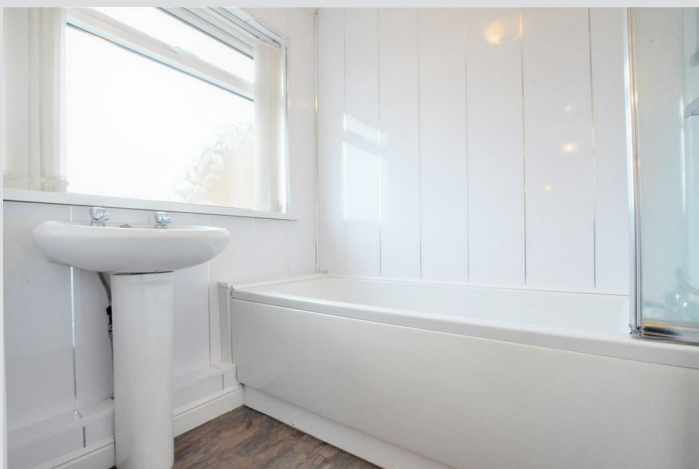
Pedestal basin, bath with overhead shower, UPVC window to rear.