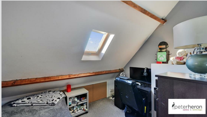
Additional eaves storage cupboards, Velux window with distant view across Fulwell skyline towards Fulwell Mill.