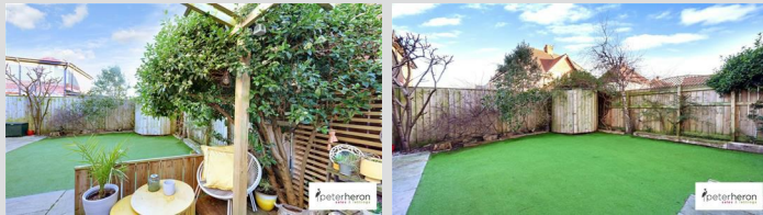
Attractive town garden to the front with artificial lawn and mature high level hedging, hard standage area, passage to side, enclosed gardens to the rear with a lovely seating area accessed directly from the kitchen leading onto artificial lawns and featuring two timber storage sheds.