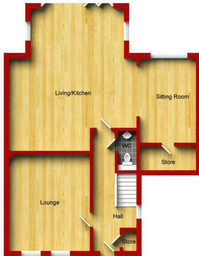
Ground Floor Approximate Floor Area 83.92 sq.m)