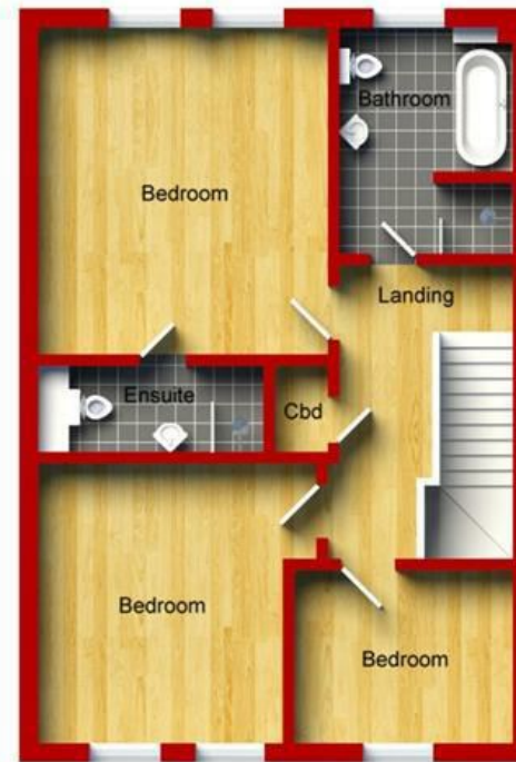
First Floor Approximate Floor Area 57.46 sq.m)