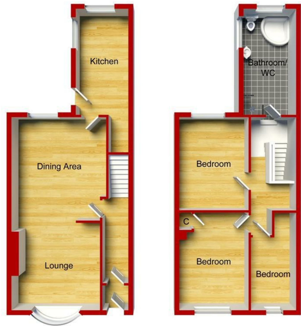
Ground Floor Approximate Floor Area (46.26 sq.m)