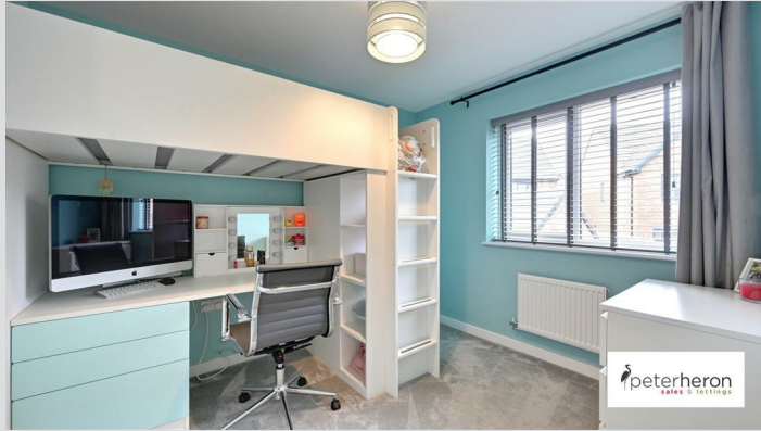
Double glazed window to the rear and a radiator.