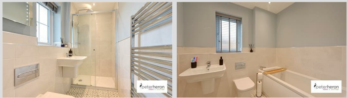
With a contemporary suite comprising of a low level WC with concealed cistern, wash hand basin set into vanity unit and a panel bath, there are part tiled walls, tiled floor, chrome ladder style radiator and a double glazed window.