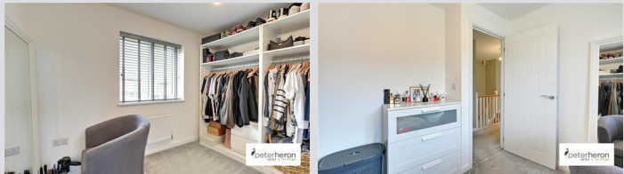
Double glazed window to the rear and a radiator.